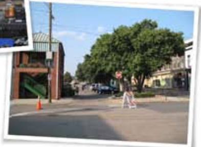
Bradford Pear Trees on 17th Street.