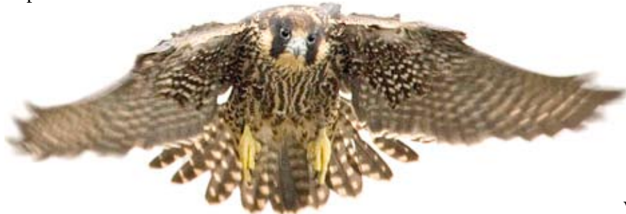
Peregrine at Shenandoah National Park.

The best part of our June camping trip to Shenandoah National Park was seeing the Peregrine Falcons at Blackrock only a few feet away from Big Meadows Lodge. The reintroduction program of these birds to Shenandoah gives eco-tourists like us the opportunity to see Peregrines. The Ranger led us to two spotting scopes set up in a clearing underneath Blackrock. We looked up at the ledge with our binoculars and watched as seven juveniles perched on branches near the hack box and flew circles overhead. They vocalized at each other. Two interns; one with the National Park Service (NPS) and one who was an Student Conservation Association had been observing the fledglings since they were released. The interns explained hacking, how they feed the fledglings quail, then gradually reduce the food so the birds will hunt on their own.