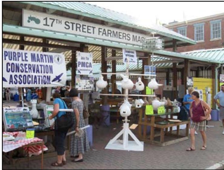
Purple Martin fans at the 17th Street Farmers Market, Richmond.

the visitor some wonderful information about their activities!