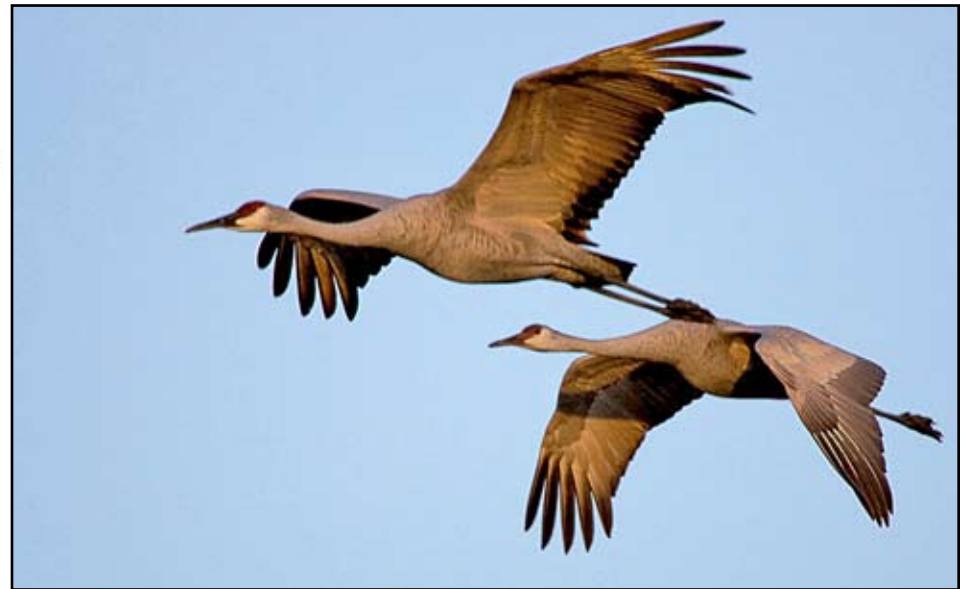
Sandhill Cranes at Bosque del Apache NWR, New Mexico.

The program on October 22nd is presented by Al Warfield and is a composite of three separate ProShow Gold presentations, which run on a set time and include sound tracks with pleasant guitar music, and birdcalls. They are only briefly narrated, as they speak for themselves.