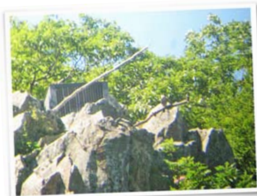
Peregrine hacking site.

a success story for the warbler, which is declining in other parts of its range. As I write this, numbers are building again at the Purple Martin roost at the 17th Street Farmer's Market. Richmond's location on the fall of the James seems to make us a great stop-over for wintering gulls. We had a fantastic show of waterfowl this past winter on the river. The eBird web site's list of observed species for the city of Richmond stands at 210. If you throw in Chesterfield and Henrico counties, the total climbs to 248. We live in a truly rich environment for birds. To make it all better, we have a knowledgeable and active group of birders who are wonderful about sharing their sightings and experiences with our community through the RAS Listserv (instructions on how to sign up can be found on the RAS website at http://www.richmondaudubon.org/ResourceCommunicat.html ). Fall migration will be picking up soon. It's great to be a birder in Virginia! Get out and take advantage – and be sure to tell us what you see.