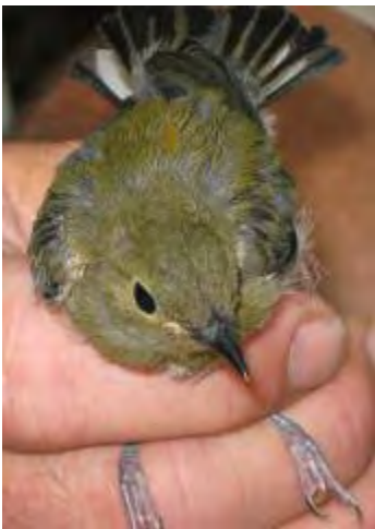
Bottom Right: Female Blackpoll Warbler.