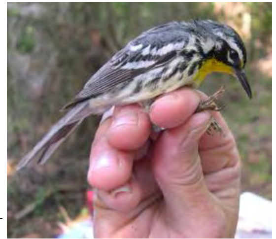
Left: Juvenile Pileated Woodpecker; Top: Female Hooded Warbler; Right: Yellow-throated Warbler