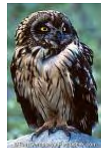
Pueo (Hawaiian Short-eared Owl)